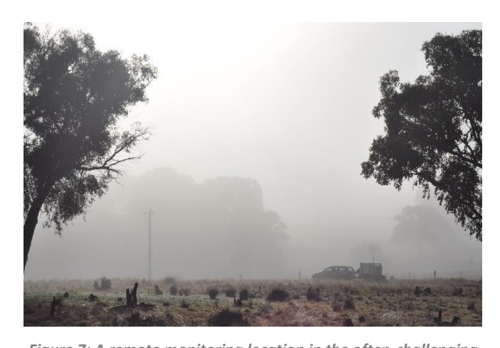
Figure 7: A remote monitoring location in the often-challenging NSW country

Between procurement and delivery, Fulcrum3D work with our clients to ensure that all access and installation factors have been considered. We will provide advice on monitoring locations as required. Our Sodar can be installed in a trailer or otherwise delivered to site on a truck and levelled from the solid steel frame.