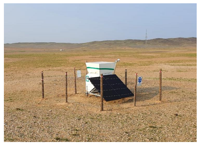
Figure 17: Fulcrum3D Sodar installation in Mongolia