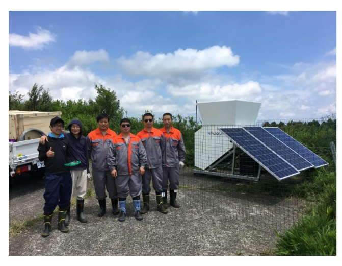
Figure 13: Fulcrum3D Sodar commissioned in Japan