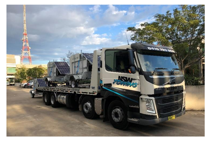
Figure 5: Three Fulcrum3D Sodars departing the factory for Western Australia

Alternatively, Fulcrum3D can provide on the ground training so that our clients have the flexibility to commission and relocate our Sodar at their convenience in the future. During all works carried out by our clients Fulcrum3D will provide remote support 24/7.