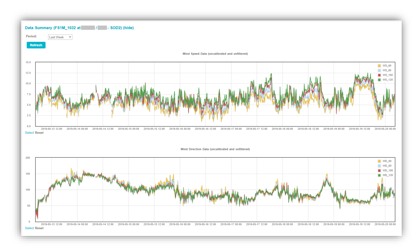
Figure 10: FlightDECK - Processed wind speed and direction time series in FlightDECK

FlightDECK performs a number of standard checks, providing alarms to our engineers and clients. Alarms include –