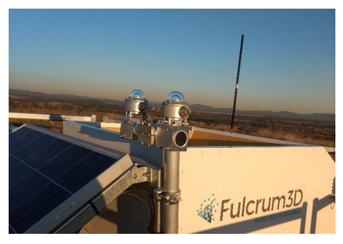
Figure 15: Solar monitoring kit - two Kipp & Zonen pyranometers