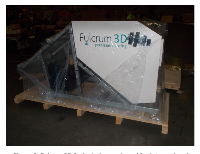
Figure 3: Fulcrum3D Sodar being packaged for international airfreight

Our manufacturing lead time is typically <6 weeks on all brand new Sodars. At Fulcrum3D we are continuing to develop our international presence, regularly airfreighting our Sodar overseas. Our rapid production is aided by our ability to ship anywhere in the world quickly, substantially reducing lead times.