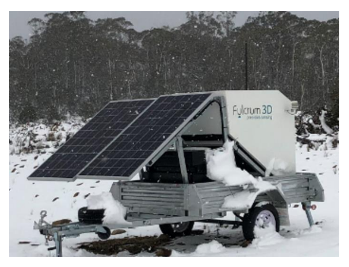
Figure 14: Snow covered Sodar in Tasmania