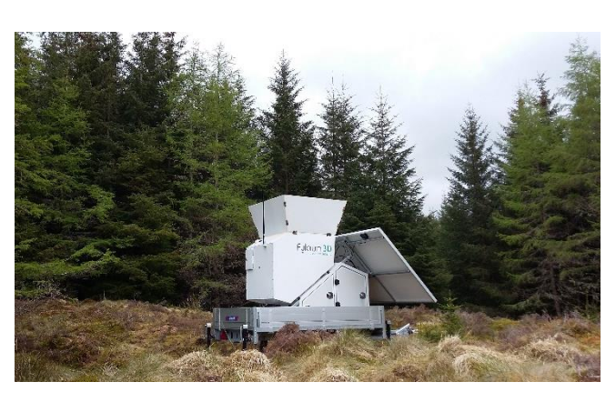
Figure 12: Heavily forested monitoring location in Scotland, UK, complete with acoustic protection baffles