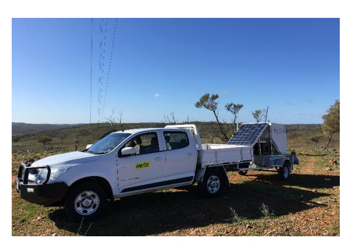
Figure 6: Accessing hard-to-reach monitoring locations is not a problem

Between procurement and delivery, Fulcrum3D work with our clients to ensure that all access and installation factors have been considered. We will provide advice on monitoring locations as required. Our Sodar can be installed in a trailer or otherwise delivered to site on a truck and levelled from the solid steel frame.