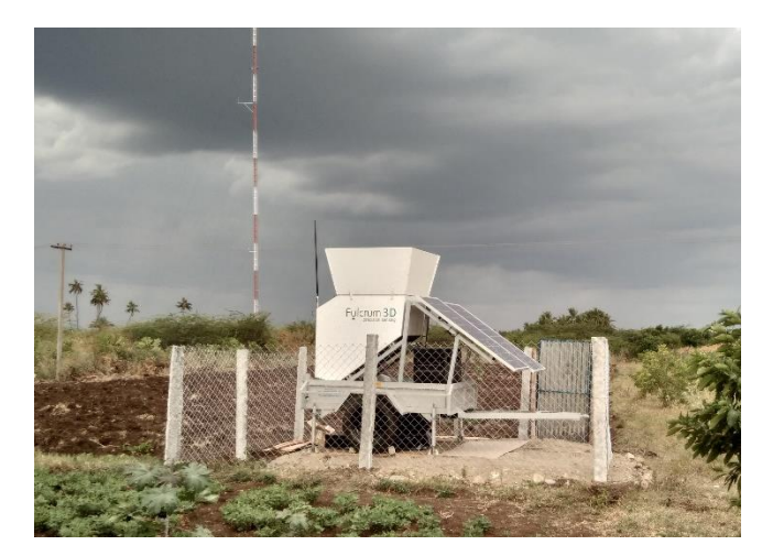
Figure 18: Installation near tall mast in India