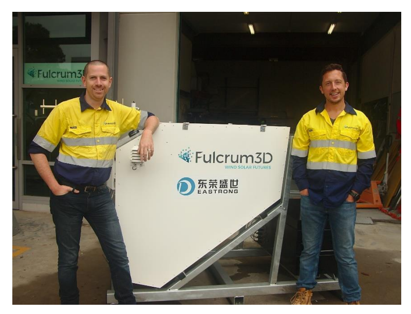
Figure 1: Factory acceptance testing completed on the new China Sodar design