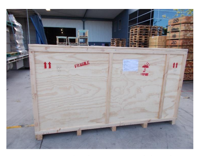
Figure 4: International grade ISPM 15 stamped plywood casing

The Sodar is packaged locally with high, quality export grade packaging before being delivered to the airport for international freight (see Figure 3 and Figure 4). Our dimensions allow for freight through commercial passenger flights allowing fast, economic deployment globally. This ensures that delivery to most destinations in Asia takes less than 2 days. The care taken with our packaging and documentation safeguards against delays in customs so that our clients receive their Sodar as quickly as possible.