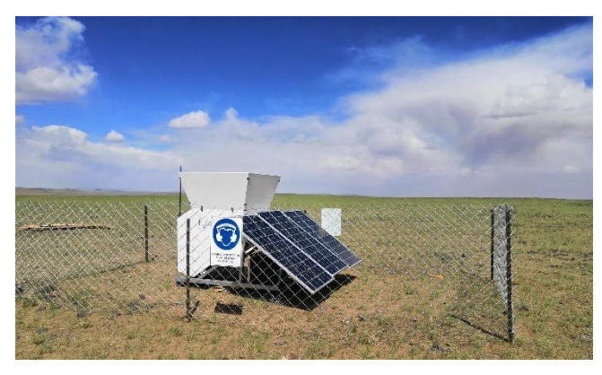
Figure 11: Fulcrum3D Sodar operating in harsh environments in

Standard configuration of the Fulcrum3D Sodar comprises of power and comms kits. Optional extras are shown below including acoustic baffles, fencing and solar monitoring.